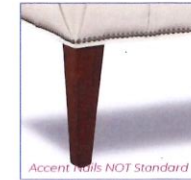
(M) TALL TAPERED LEG