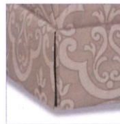
(A) KICK PLEAT SKIRT