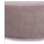
(K) HIDDEN CASTERS