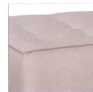
OTT-05 MODERN BUTTON