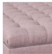
OTT-01 TUFTED Accent Nails NOT Standard