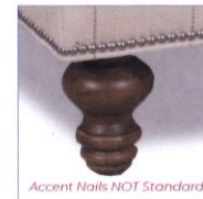
(F) TURNED LEG