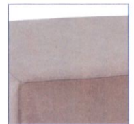
OTT-06 TIGHT BOX BORDER