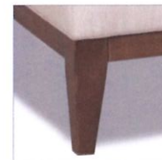
(J) TAPERED LEG WITH WOOD BASE