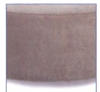
(G) HIDDEN LEG