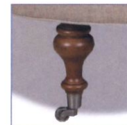
(H) TURNED LEG WITH CASTER Standard caster finish: Brass Nickel finish available.

Storage is available with A, C, G and K bases only.