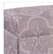
OTT-02 TIGHT/PLAIN NOT Available on 2021